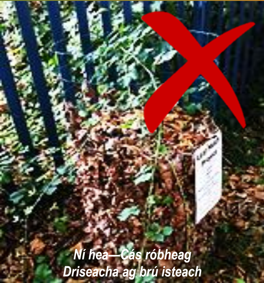
Ní hea—Cás róbheag Driseacha ag brú isteach

Coimeád na cásanna saor ó eidhnán, ó ialus nó ó dhriseacha ionas nach ndéanfaidh na fiailí seo an múirín duillí a thruailliú.