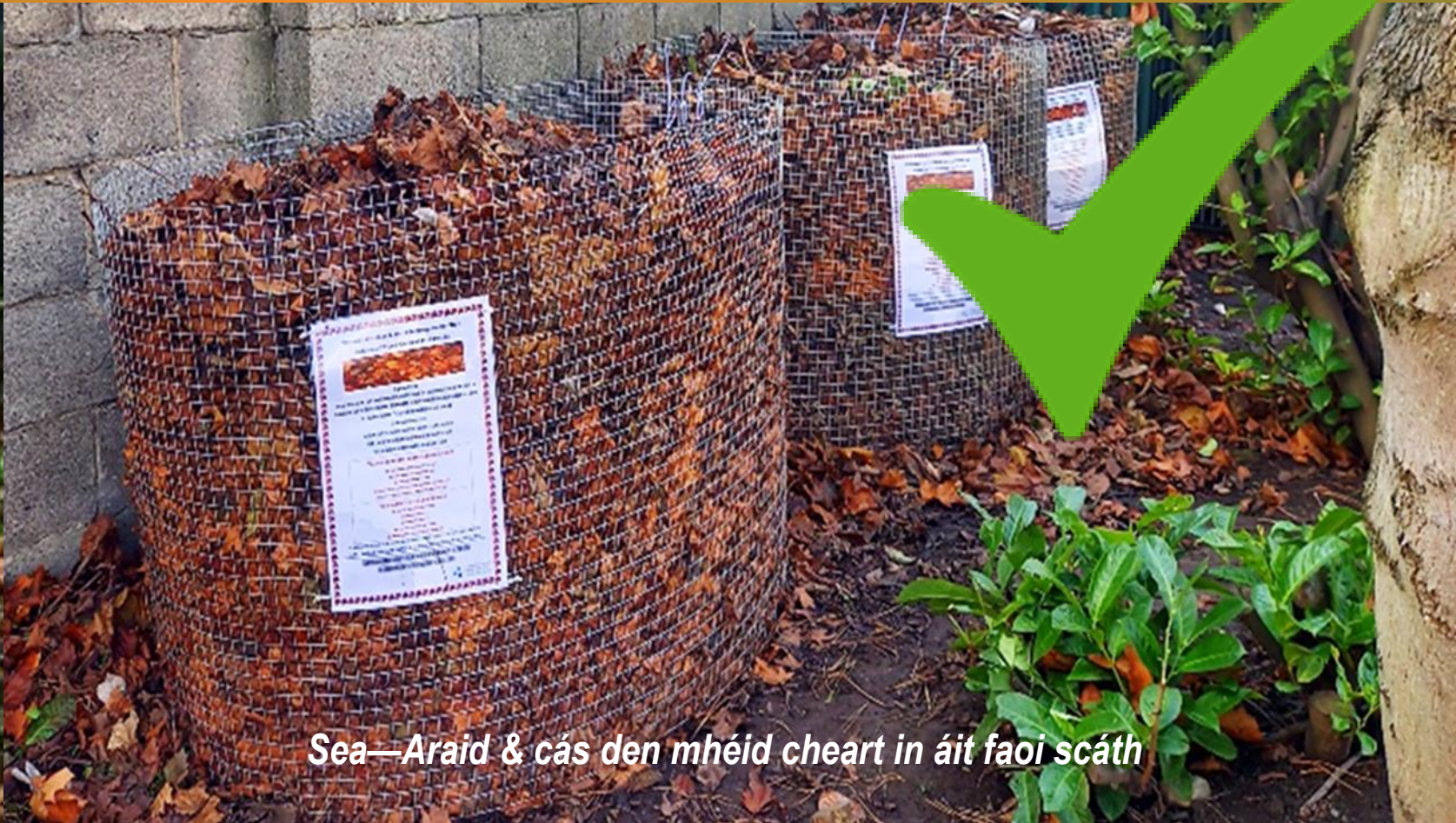
Sea—Araid & cás den mhéid cheart in áit faoi scáth